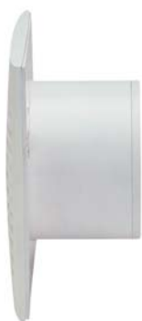
17mm actual profile

With a slim profile of only 17mm, Silhouette blends in with the wall surface to provide an unobtrusive installation. Silhouette has a FID performance of 21 l/s. Silhouette can be ceiling/panel mounted and connected to an appropriate duct run to the outside.