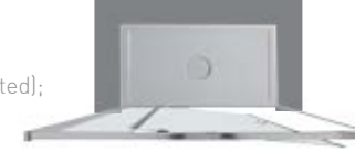
Versione nicchia Niche version