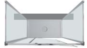
Versione centro parete Center wall version