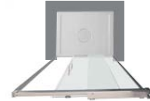
Versione nicchia Niche Version