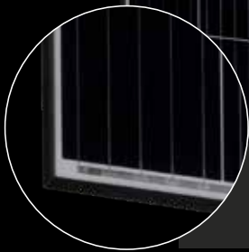
BLACK | WHITE

✓ 15 years manufacturer's warranty 25 years linear performance guarantee