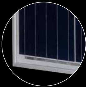
SILVER | WHITE