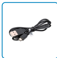
Micro USB Cable