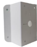
DS-1276ZJ-SUS Corner Mounting Bracket