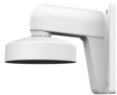
DS-1272ZJ-110-TRS Wall Mounting Bracket