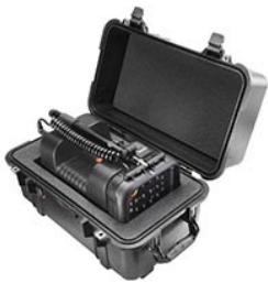
1460AALG 1460 Case with custom fit foam