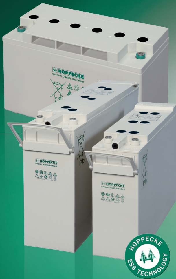
Similar to the illustration